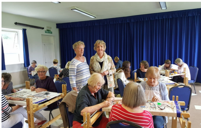
Above : Penelope Keith meets the Llangwm tapestry stitchers, who later featured on her Channel 4 programme 'Hidden Villages'.

One session - morning/afternoon/evening - £10 per session Adult Party - £35 Children's Party - £25 Charity Event - £10 Summer Wedding - £150 Winter Wedding - £175