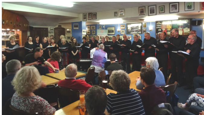
The LitFest also gave Llangwm's Village Voices the chance to shine by linking up on the Friday evening (12 Aug) with their annual concert for the Rugby Club President's charity. £620 was raised for the Wales Air Ambulance appeal.