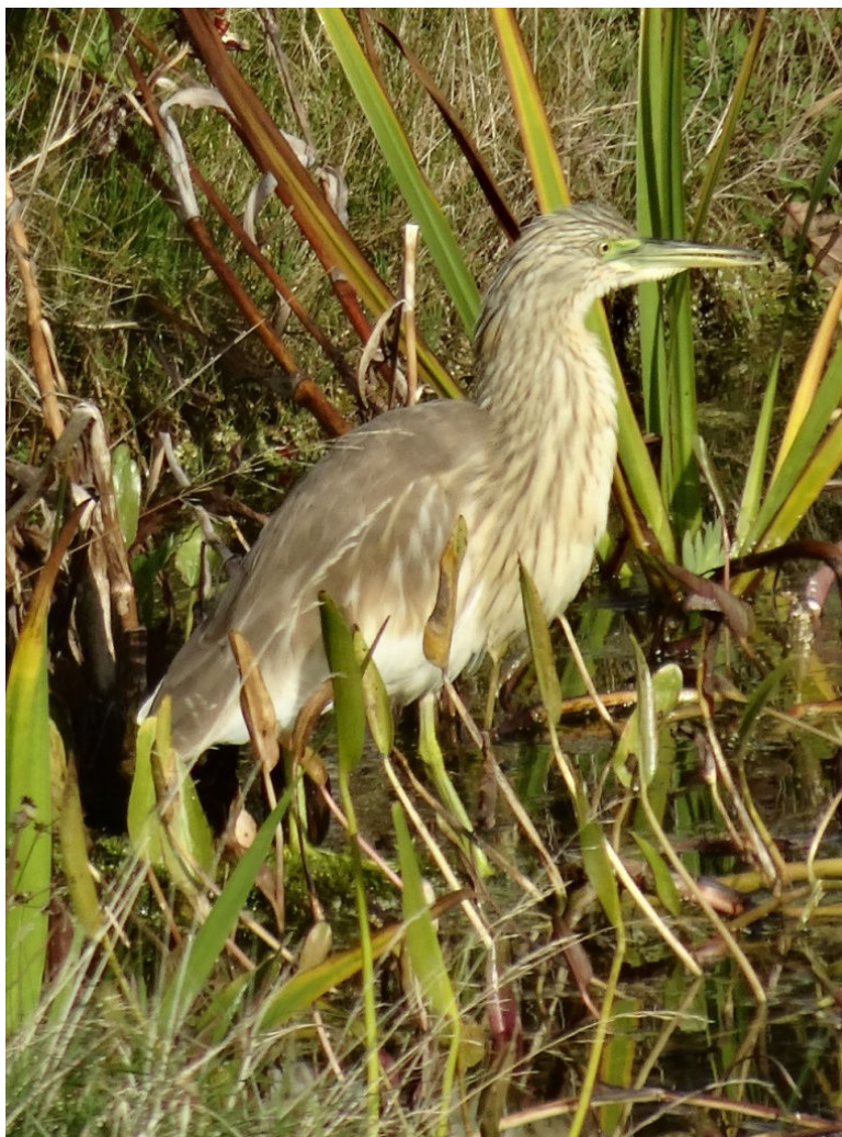
The Squacco Heron, a notably rare visitor to these shores, caused a stir among ornithologists recently. (Photographed at Llangwm Ferry.)

On 27 October another very rare visitor was heard calling in the ash