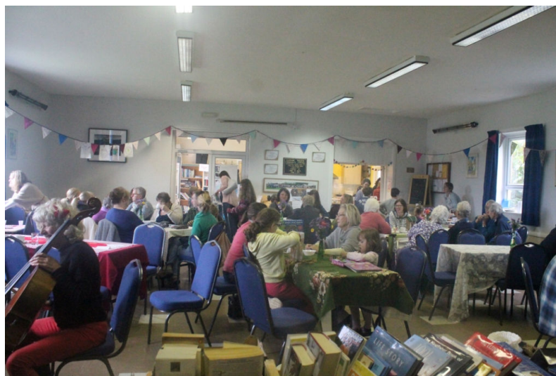
Below: The busy pop-up café in aid of the children of Syria and the Yemen. A worthwhile cause and a chance to meet up for a chat!