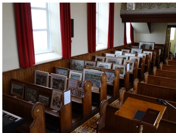
The Festival's improvised art gallery at the Methodist Chapel on Llangwm Green.