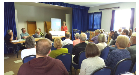
A well attended event at the village hall during the Llangwm Festival gave people the chance to 'Meet the Experts'

We also learnt that one of Llangwm's residents is a direct descendant of Godebert the Fleming, the founding father of this village, and that his DNA is so rare and unusual that we were able to trace from where his ancestors came and how they got to Flanders and then to South Pembrokeshire.