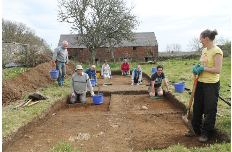
Start of the Dig at Great Nash Farm.

some of the fragments of pottery found prove that there was a medieval residence there in the mid to late 1100s. Where previously we had thought that the De la Roche family settled there after 1244, it now