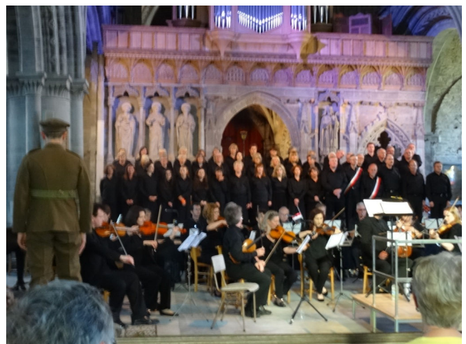
Combined choirs and orchestra perform Llangwm's village opera in concert in the magnificent setting of St Davids Cathedral in June.