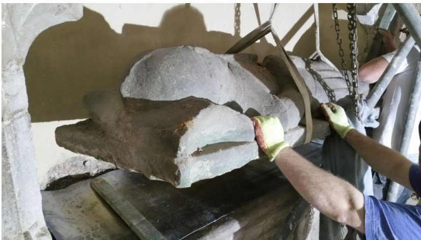
The moment the effigy is lifted in St Jerome's Church, to dry out and preserve the memorial.

We have conducted an archaeological dig at Great Nash Farm and have discovered that